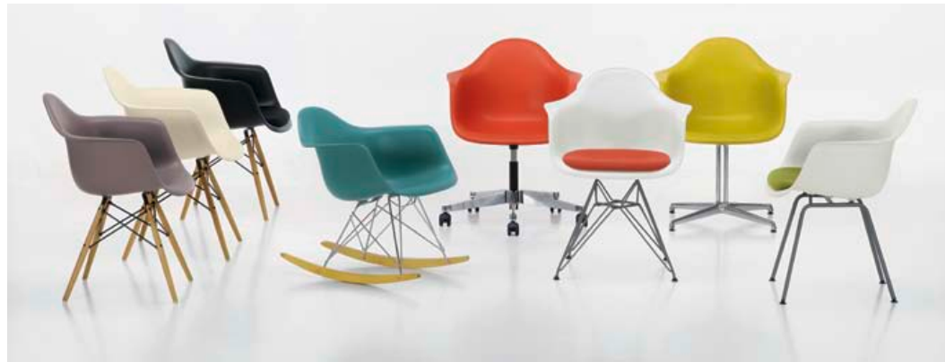
Depending on which colour, padding, and base you choose, the Plastic Armchair can fulfil all kinds of needs and preferences. RAR is not available upholstered.

The seat shell is available in 8 different colours and can be combined with either a padded or fully-upholstered seat in 13 different colours. There are several bases to choose from and a wide range of individual combination possibilities – the Plastic Armchair with powder-coated base (in dark grey) is suitable for outdoor use.