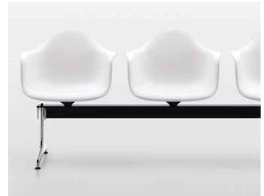
Several Eames Plastic Armchairs mounted on a crossbar are ideal for waiting areas.